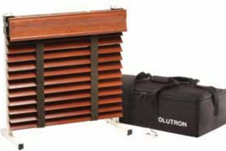
Venetian Demo P/N VENETIAN-DEMO-WD (shown) P/N VENETIAN-DEMO-AL (aluminum demo also available)

All marketing materials can be ordered using the shade configuration tool (SCT). PDFs are also available online at www.lutron.com under Service and Support.