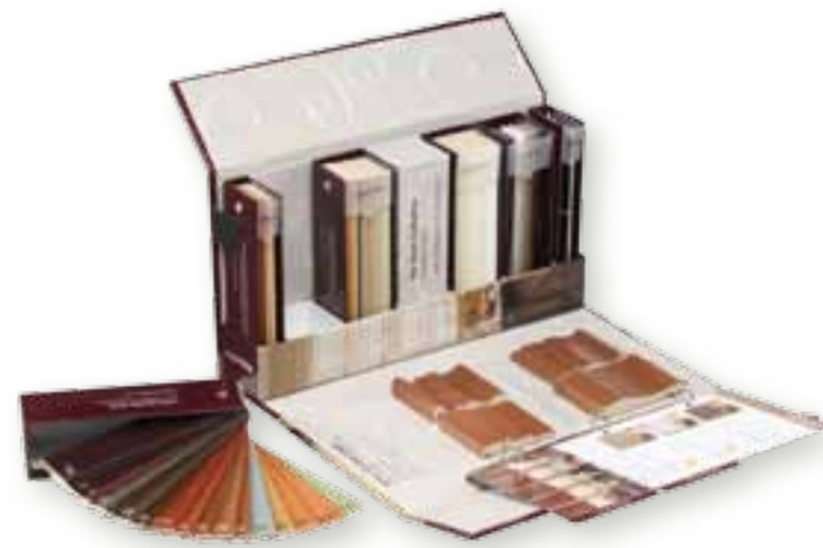
Venetian binder P/N VENETIAN-BINDER